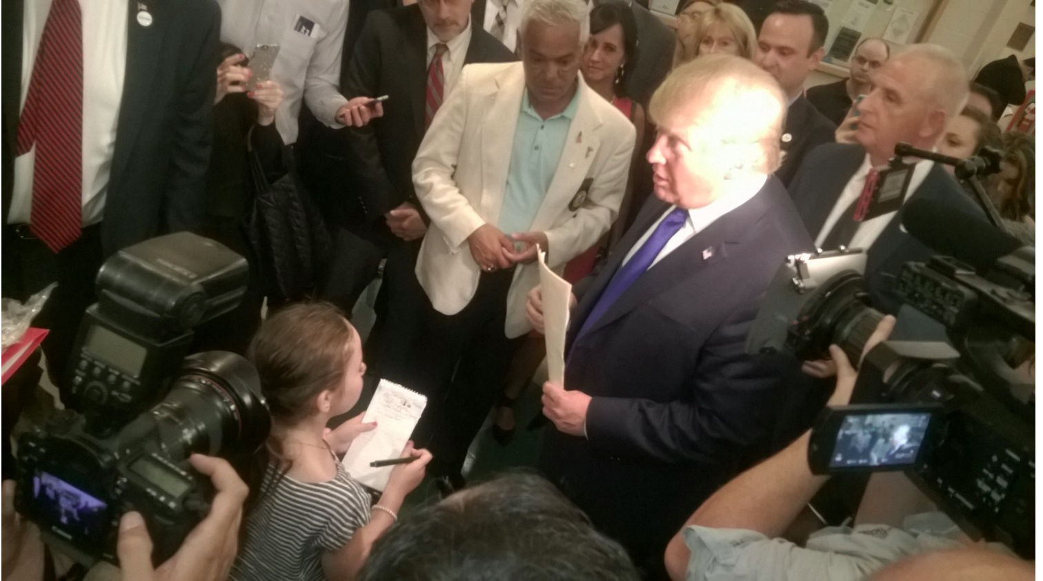
(Mr. Trump and I at Pinkerton Academy in Derry, NH 8/19/15. Note Mr. Trump is holding a copy of the Woodward Weekly News)