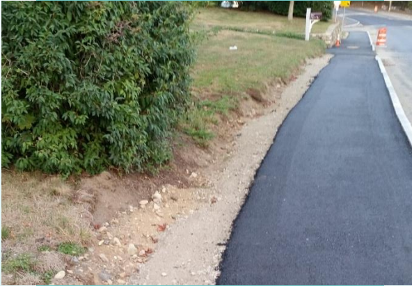
Examples of temporary easements for grading