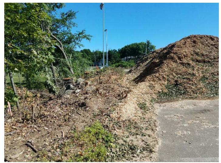
Photo depicts the tree cutting and clearing adjacent to the Woodward School soccer field and Golf Club parking lot on 6/25/18.