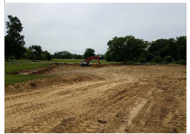
Photo depicts the septic field trenching for the septic chambers on 6/27/18.