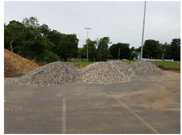
Photo depicts the delivered double washed crushed stone for the septic field chamber base course on 6/26/18.