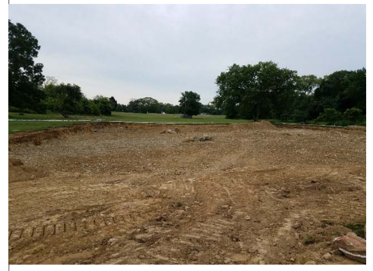
Photo depicts the septic field excavation, prior to trench excavation for the septic chambers on 6/26/18.