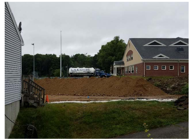
Photo depicts the sewage tanks pumping of Woodward School on 6/28/18.