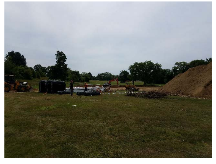
Photo depicts the septic field excavation work and septic chambers, piping, accessories.