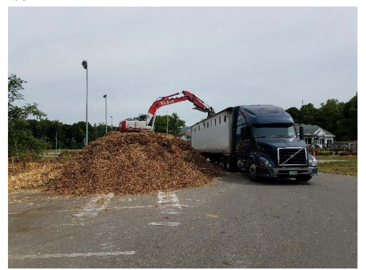
Photo depicts loading and hauling off site of the tree cutting chipping mulch material on 6/27/18.