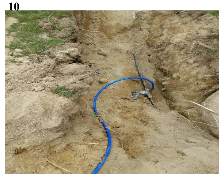
Photo depicts the tracing and connection of the Golf Clubhouse waterline on 6/25/18.