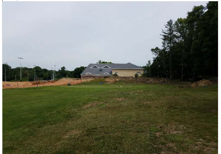
Photo depicts progress of the tree cutting work adjacent to Woodward School on 6/26/18.