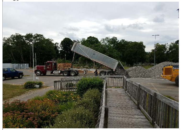
Photo depicts the delivery of the double washed crushed stone on 6/25/18.