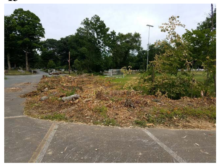
Photo depicts the tree cutting and clearing adjacent to the Woodward School soccer field on 6/25/18.