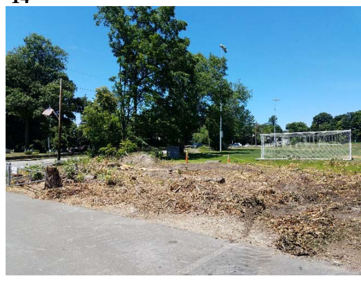
Photo depicts the tree cutting and clearing adjacent to the Woodward School soccer field on 6/25/28.