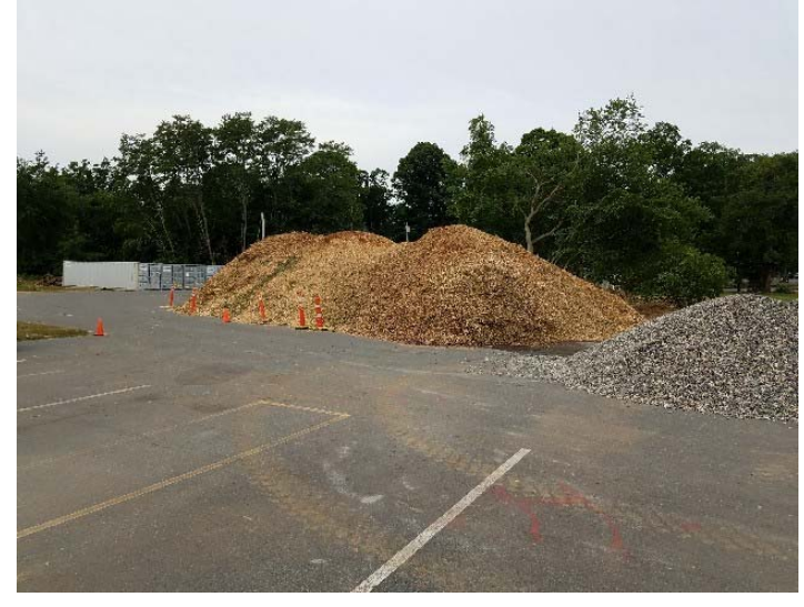
Photo depicts the tree cutting chipping mulch pile prior to hauling off the site on 6/26/18.