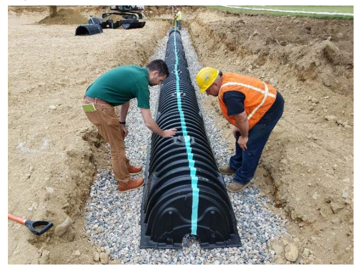
Photo depicts the septic field installation of the septic chambers for civil engineer inspection on 6/27/18.