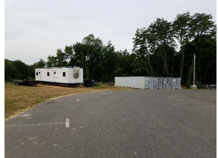
Photo depicts the dropped off Golf Clubhouse office trailer and four conex boxes for golf cart storage on 6/26/18.