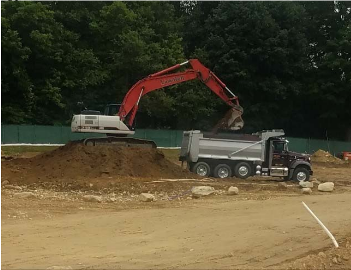
Photo depicts the loading of excess loam from the site on 7/26/18.