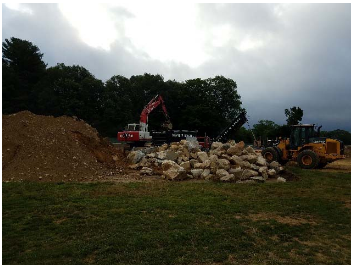
Photo depicts the excavated site rocks and boulders on 7/26/18.