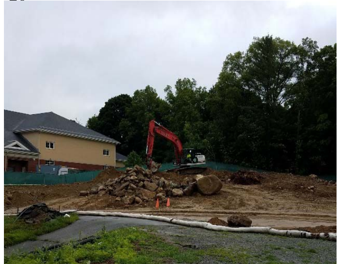
Photo depicts the on-going site excavation work, rocks and boulders near Woodward School side on 7/26/18.