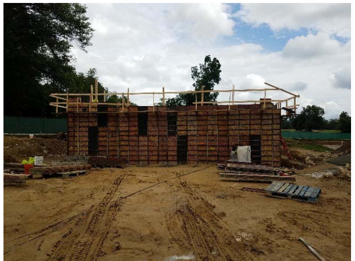
Photo depicts the Golf Clubhouse foundation walls ready for concrete pour on 7/26/18.