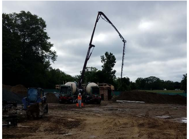
Photo depicts the Marguerite Concrete foundation walls concrete pour on 7/26/18.