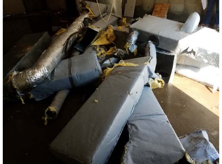
Photo depicts the demo Golf Clubhouse AC ducts on 7/27/18..