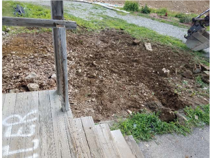
Photo depicts the complete demo of the Golf Clubhouse wood deck on 6/26/18.