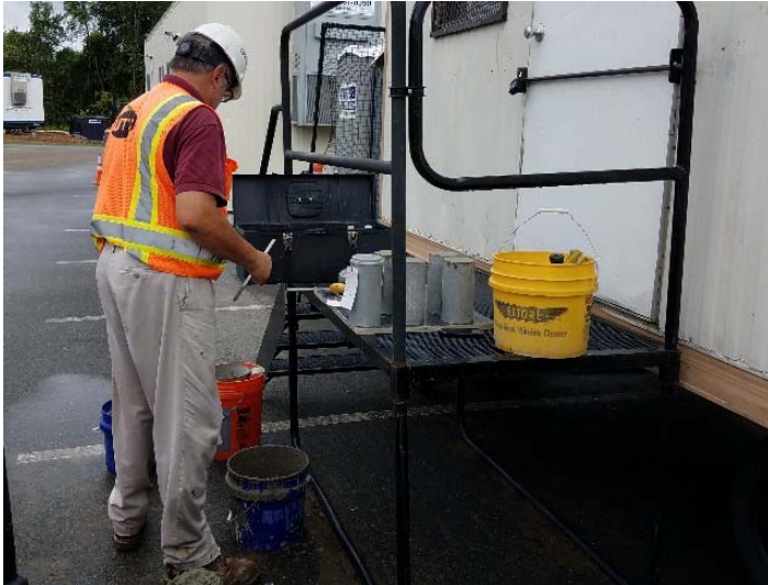
Photo depicts the UTS of Mass concrete inspection and testing on 6/26/18.