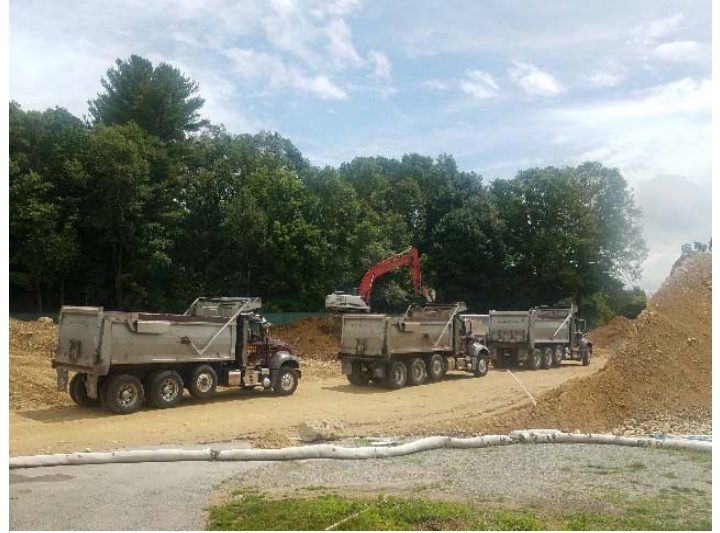
Photo depicts the removal of excess loam from the site on 7/25/28.