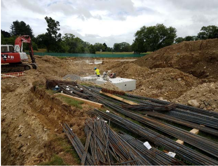
Photo depicts the delivered Public Safety Bldg. steel rebar on 7/25/18.