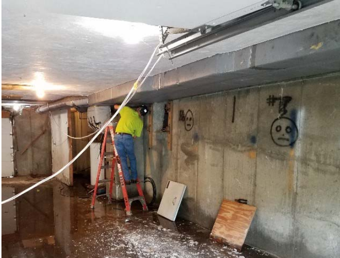
Photo depicts CAM HVAC demo of the Golf Clubhouse basement AC ducts on 7/27/18.