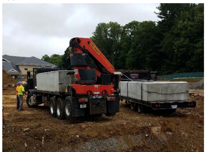
Photo depicts the 11,000 gallon septic tanks delivery and installation on 7/23/18.