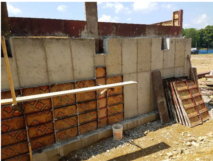
Photo depicts Marguerite Concrete stripping foundation forms from new Golf Clubhouse foundation on 7/27/18.