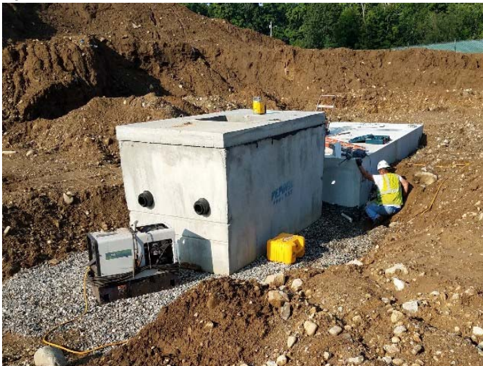
Photo depicts progress of the Septic tanks installation work on 7/26/18.