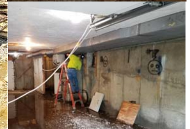
Picture: Relocated Golf Clubhouse foundation walls.