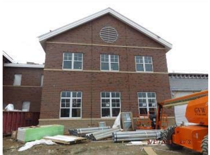
Photo depicts the installation of windows.