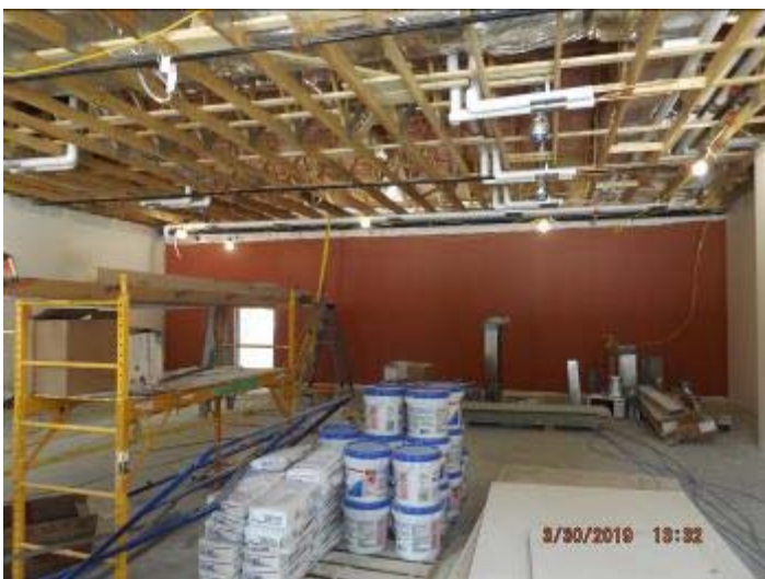
Photo depicts the progress of second floor fitness room.