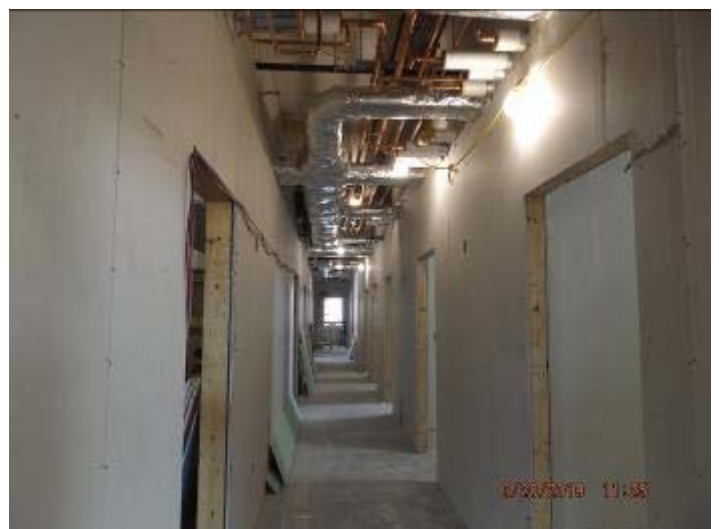
Photo depicts the progress of the second floor dorm room hallway