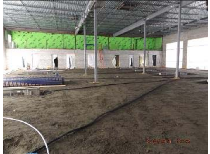
Photo depicts the progress of slab preparation for the apparatus bay.