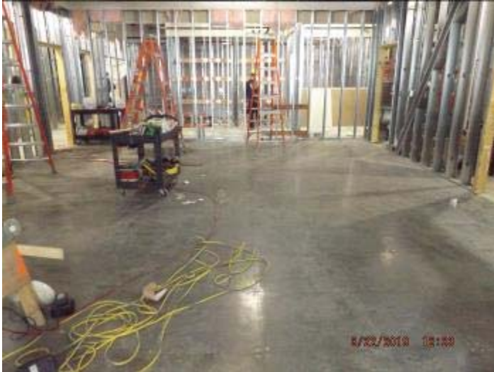
Photo depicts the progress of first floor dispatch area.