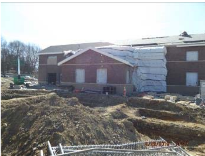
Photo depicts the progress of the exterior.