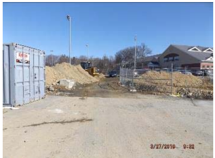
Photo depicts golf access road.