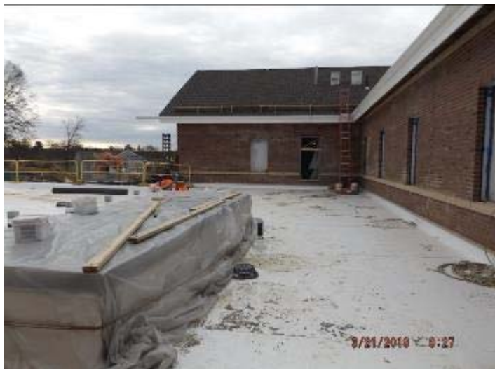
Photo depicts the progress of the lower flat roof.