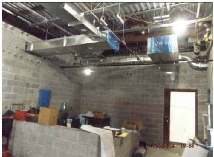
Photo depicts the progress of first floor Booking area.