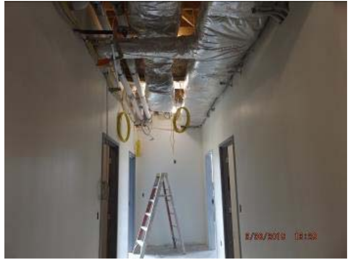
Photo depicts the progress of the second floor framing, drywall, painting, electrical and HVAC on police side.