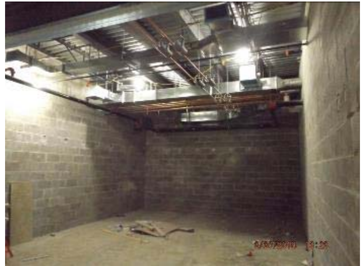
Photo depicts the progress of first floor turnout gear room.