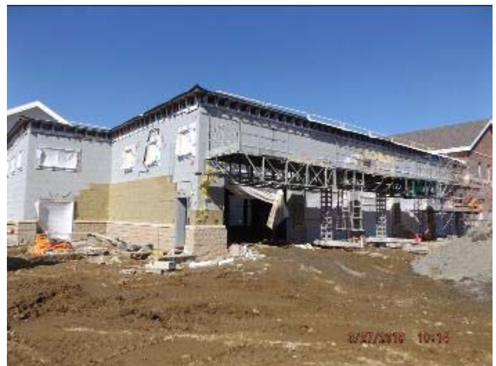
Photo depicts the completion on-going masonry at the apparatus bay.