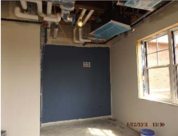
Photo depicts the progress of Police Chief's office on the second floor.