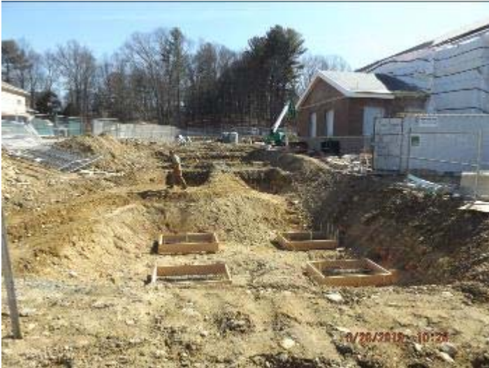
Photo depicts the progress of excavation, and forming of the footings.