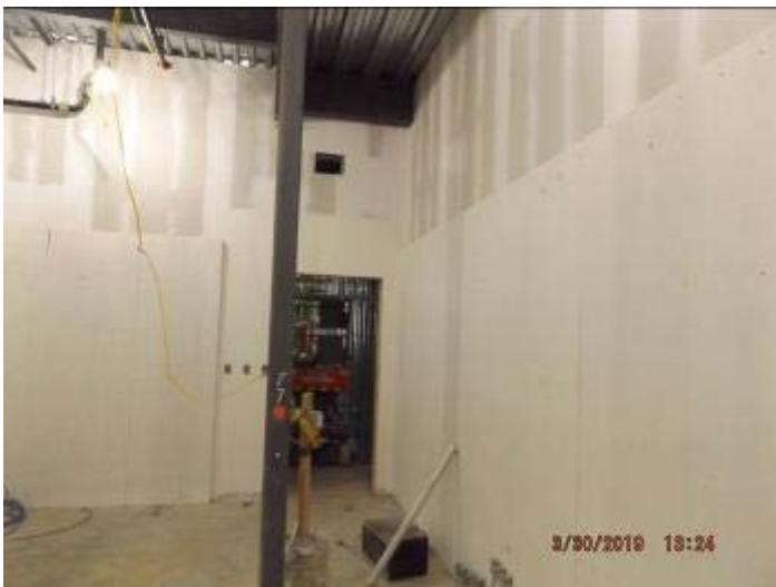
Photo depicts the progress of the first floor electrical room