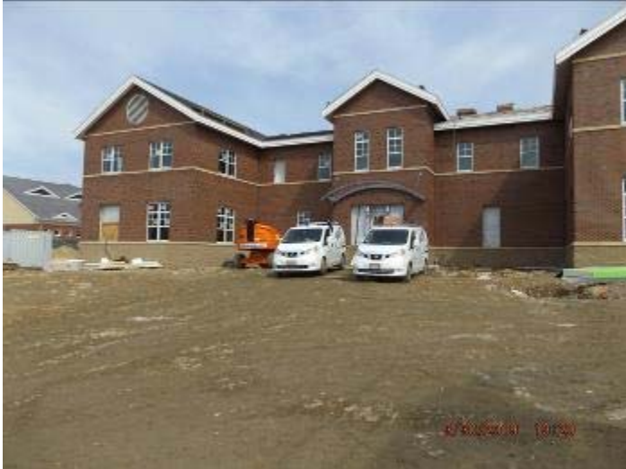
Photo depicts the progress of the exterior at the main entrance.