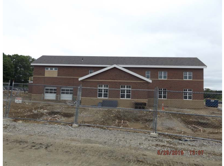
Photo depicts the exterior progress on the west end of the building.