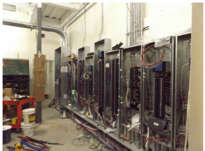
Photo depicts the progress of the electrical room.