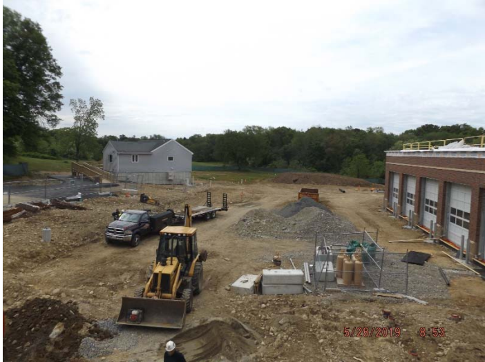
Photo depicts the progress of excavation for generator pad, and tight tank drainage line.