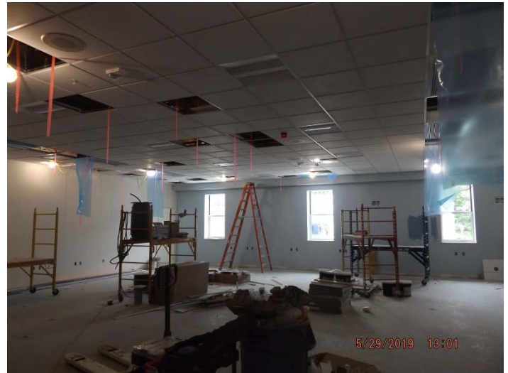
Photo depicts the progress of the fitness room