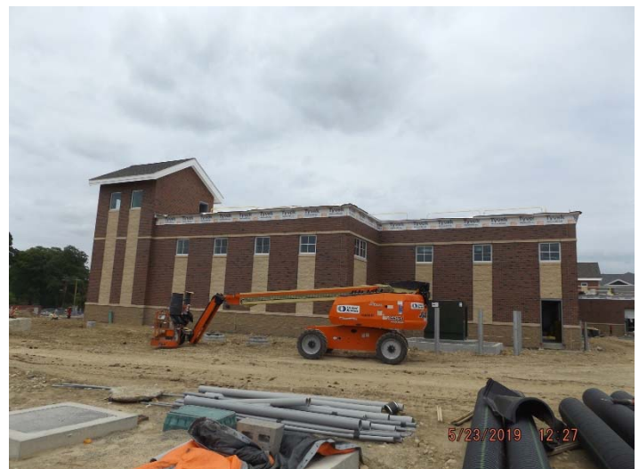
Photo depicts exterior progress on the east side of the building.