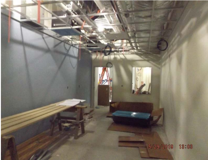
Photo depicts the progress of the first floor.