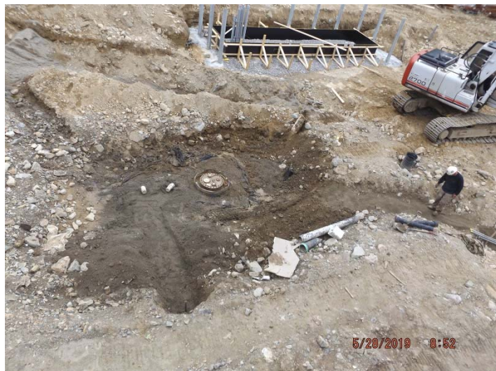
Photo depicts the progress of the generator pad, and tight tank.