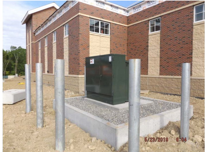
Photo depicts the installation of the transformer.