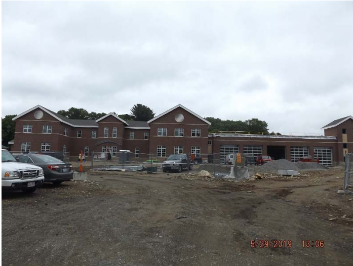
Photo depicts the progress of the exterior of the front of the building.