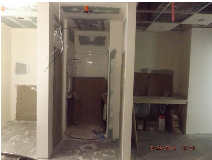
Photo depicts the progress of plumbing fixtures on the second floor