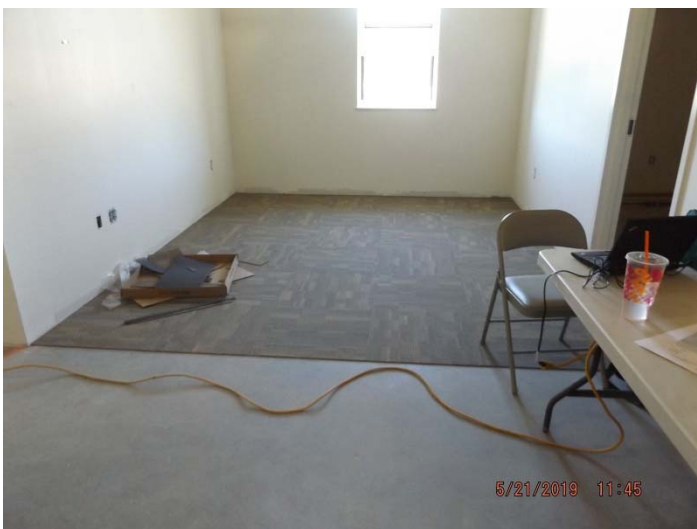
Photo depicts the progress of the second floor carpet.