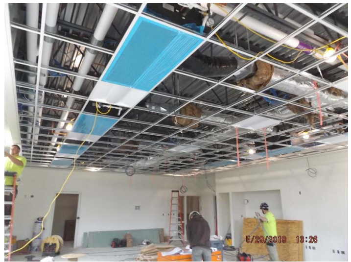
Photo depicts the progress of the training room.