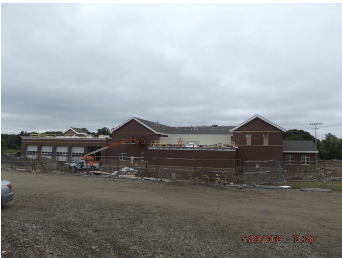
Photo depicts the progress of the exterior of the rear of the building.