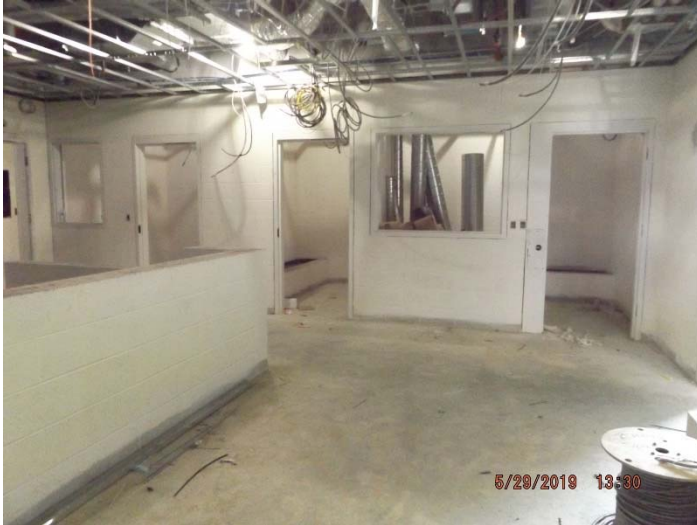
Photo depicts the progress of the booking area