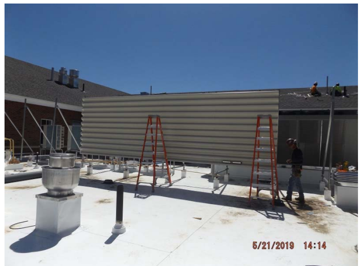
Photo depicts roof screen, and antenna bracket installation.