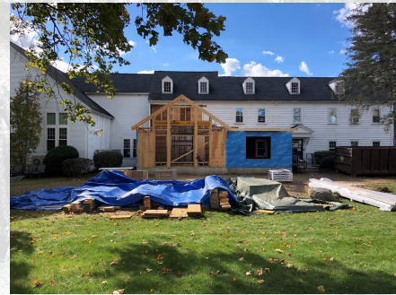
photo of Cordaville Hall construction