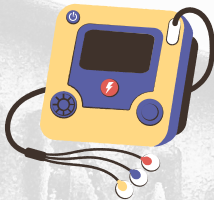
photo of AED machine